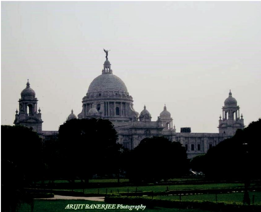
ARIJIT BANERJEE Photography