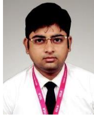
By Arijit Bannerjee, Semester II (3year), LL.B

What is Reservation? The word 'reservation' can be defined as reserving or keep ing back or holding something. It is a kind of process to provide facilities to the people belonging to the weaker sections of the societies in the areas of scholar- ship, education, government service, jobs, and in other spheres in which they are not being represented properly. The reservation system is under the control of constitutional laws, statutory codes, local rules and regulations. In India caste based reservation is also known as Quota. The caste based reservation system was introduced on 1st January, 1979 by Mandal Commission during the PM era of Late. Morarji Desai to uplift the rejected classes of India who were neglected by the Upper classes during the British Rule and even after Independence till the Caste based reservation came into force.