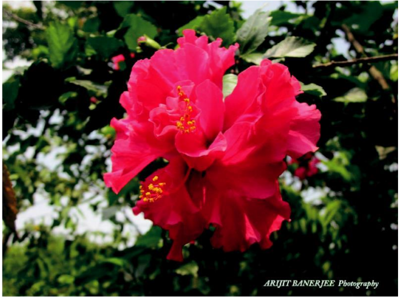
ARIJIT BANERJEE Photography